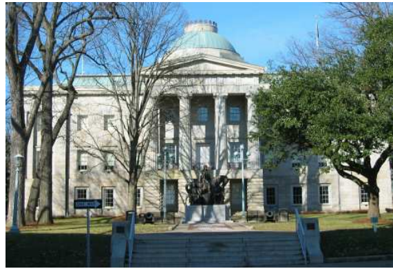
State Capitol Building Raleigh, North Carolina

This veteran government relations executive knows and understands state government and public policy. He understands the dynamics of corporate boards, trade associations and coalitions. He also has the essential communication skills to meet the demands of each.